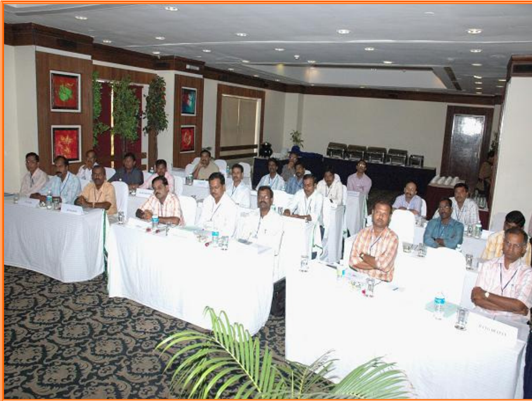
Workshop in progress on “ Disaster Management ”