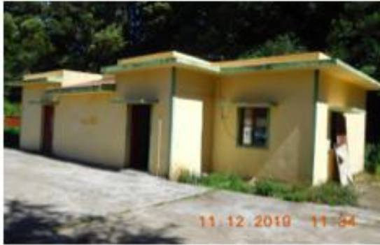
Renovation of police guard room