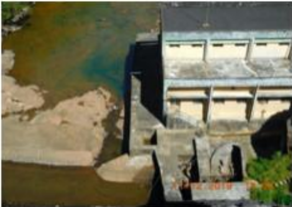
Power house left side protection works on downstream right flank of dam