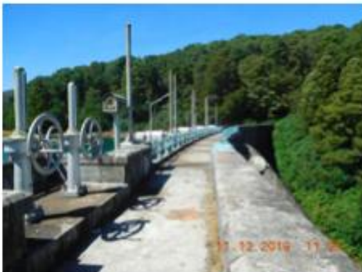
Spillway gate and motors overhauling