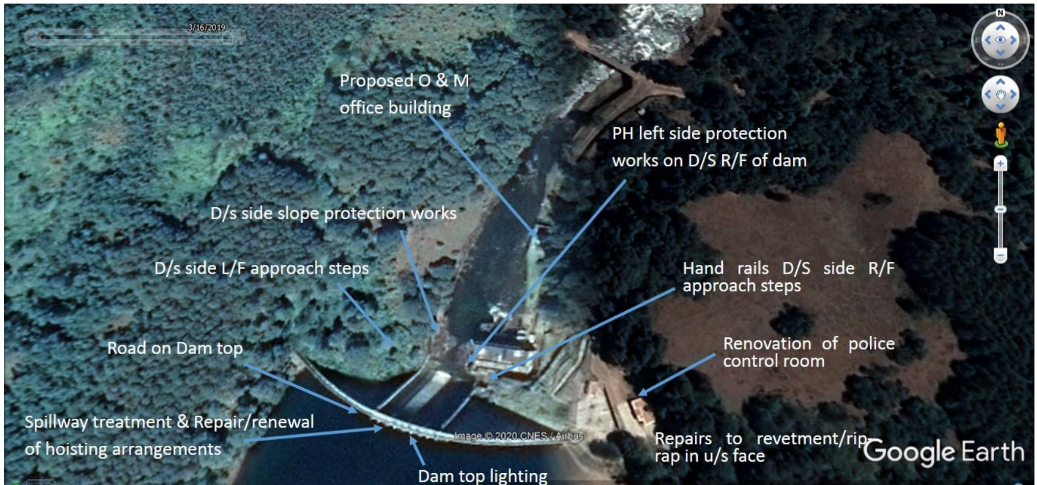
Figure 1.2: Project Area showing major intervention locations