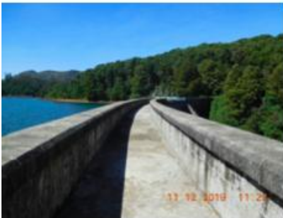
Dam top drainage by screed concrete