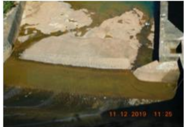
Spillway bucket lip repair works