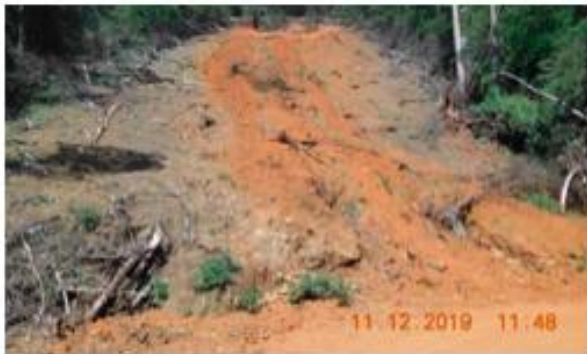
Dam approach road renovation work