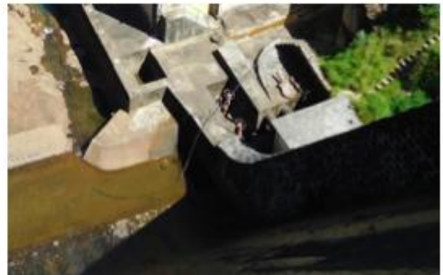
Overhauling of scour vent gate screw rod mechanism