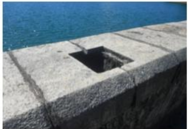
Construction joint (on parapet wall) top opening