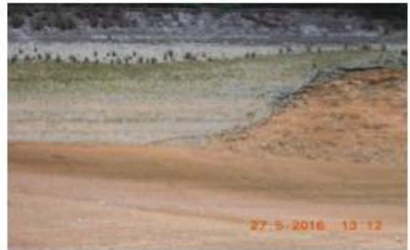
Saddle Dam rip-rap renovation work