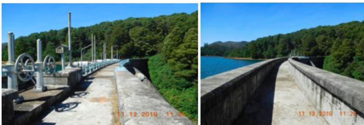
View of Dam