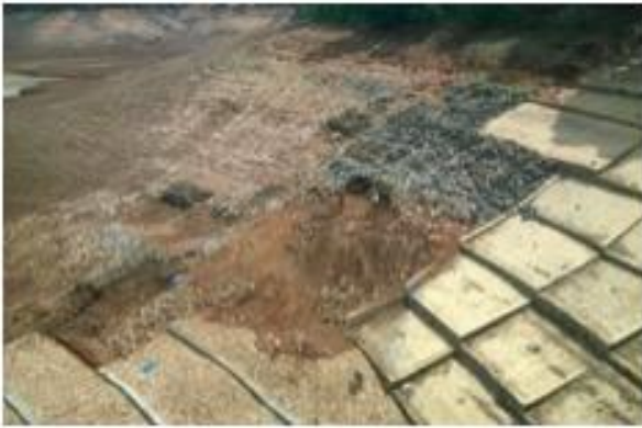
Upstream left flank slope protection work