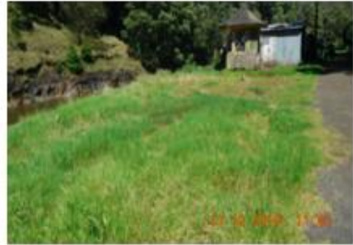
New O & M office building in place of existing tin