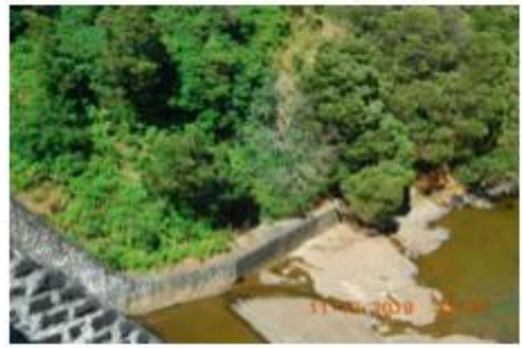
Downstream left flank side- slope protection work