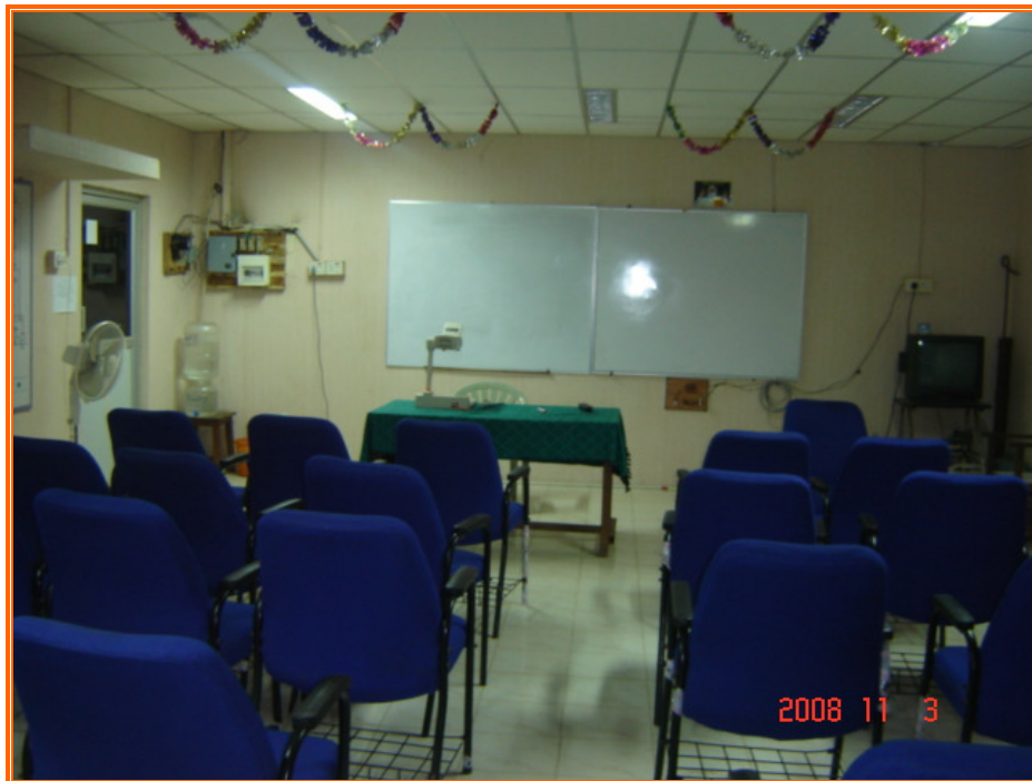
AC Lecture Hall II