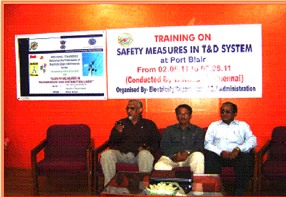
Our General Manager / HRD Inaugurating the Training on Safety Measures in T and D at Port Blair