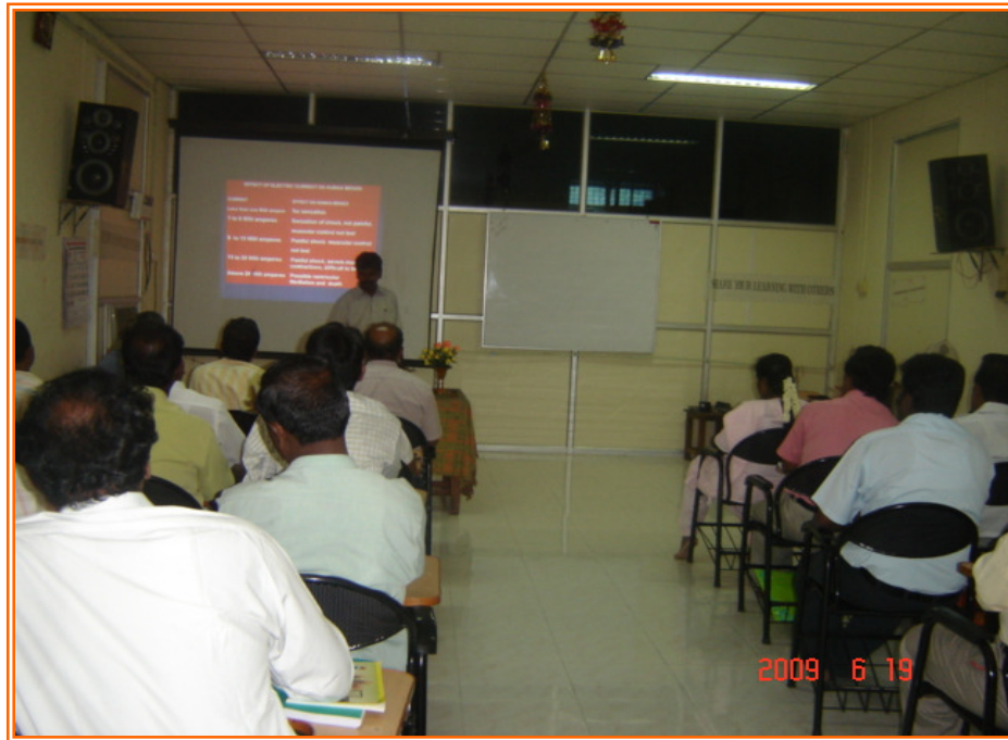
AC Lecture Hall I